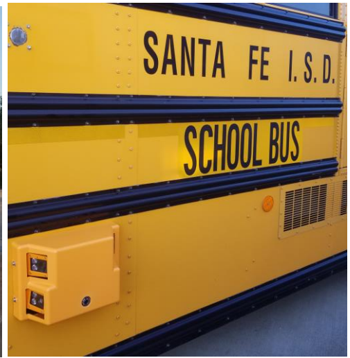
A Santa Fe ISD bus with installed camera system.