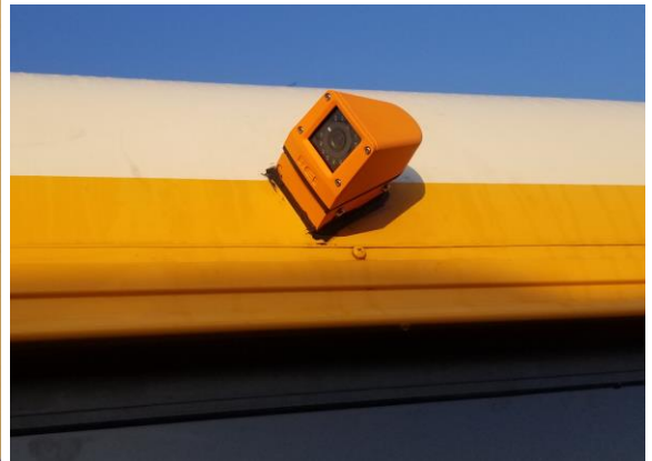
A close up view of camera system with license plate reader and OverWatch video camera.