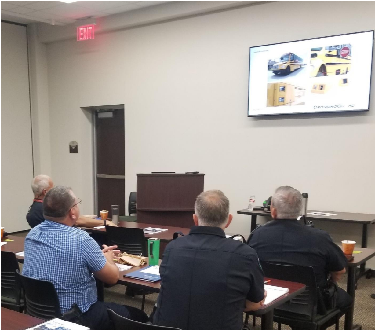
SFISD Police Officers training for violation approval process. Verra Mobility reports that only 1 percent of violators have a repeat offense.